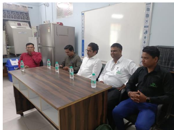
Faculty members and guests.