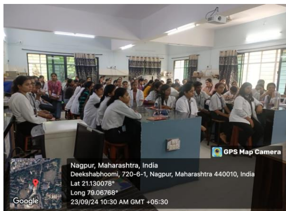
Students attending the programme.