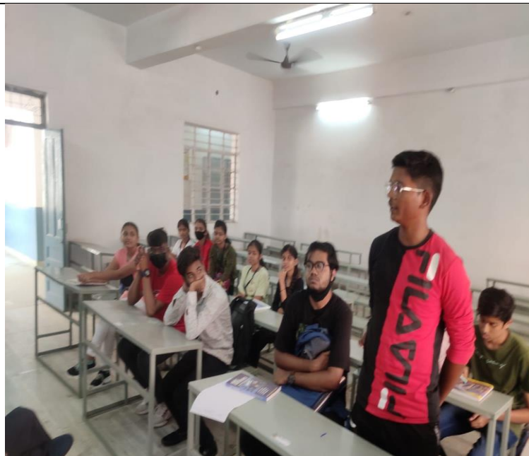
Students giving introduction to teachers