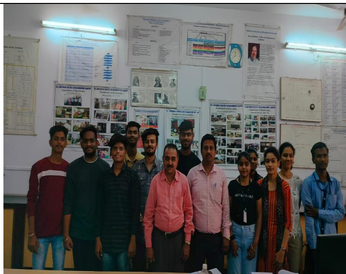
Group Photograph with Chief Guest faculty and Students