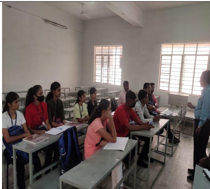
Induction Program conducted by Deptt. of Electronics