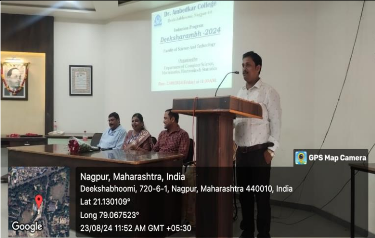
Introductory Speech to students in presence of principal & staff.