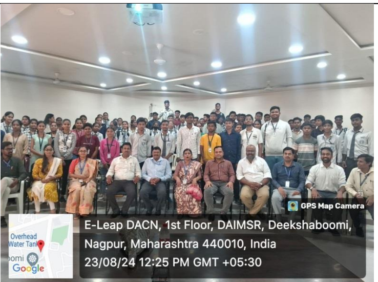
Group Photograph with faculty and Students