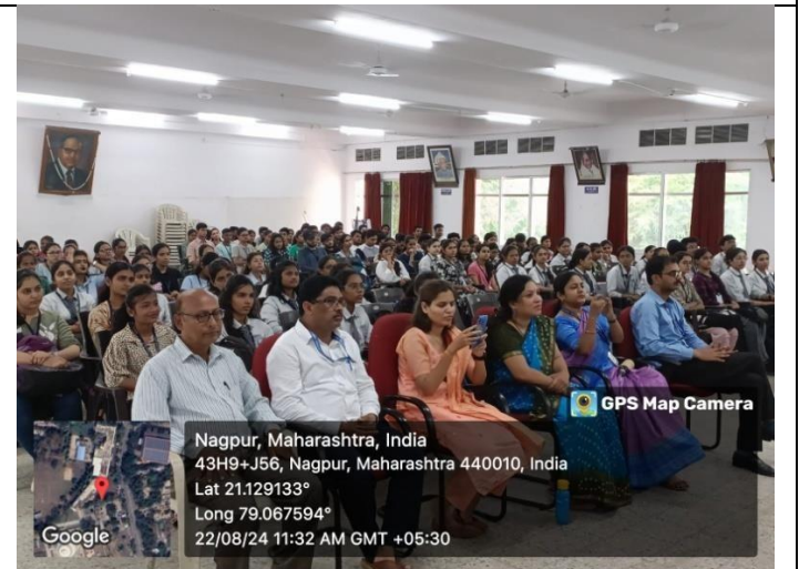
Students participated in the program