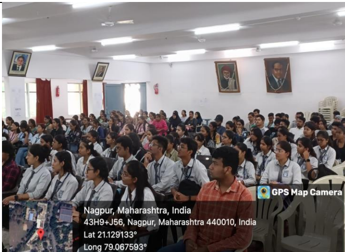
Students participated in the program