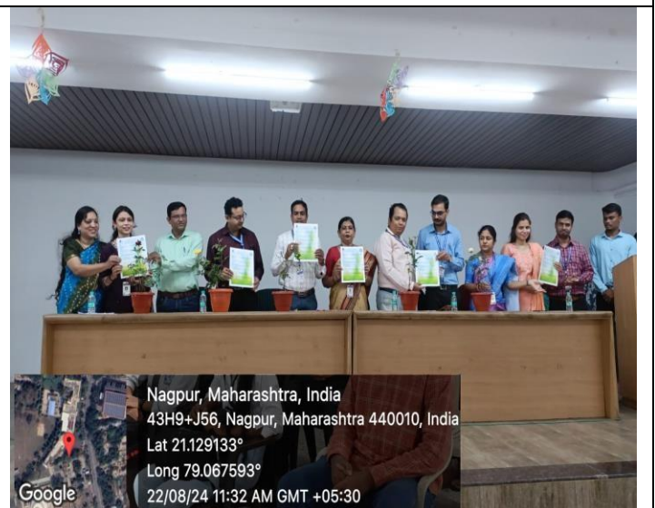
Inauguration of the Biochemistry and Biotechnology Society by staff members of the Department