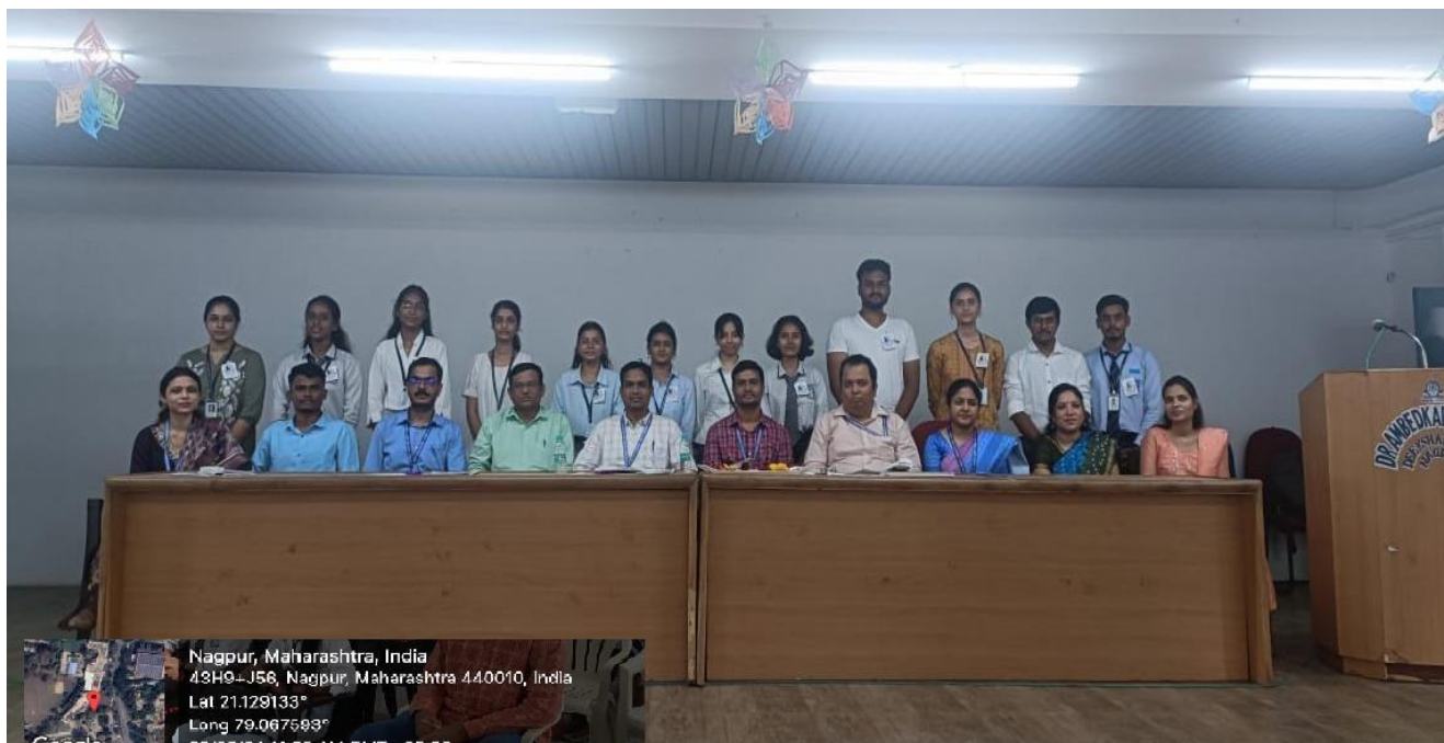
Working committee Members and faculty members of BBS