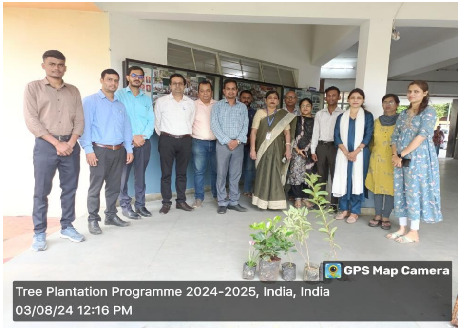
All the Teaching and non-teaching staff gathered for the Tree Plantation Program