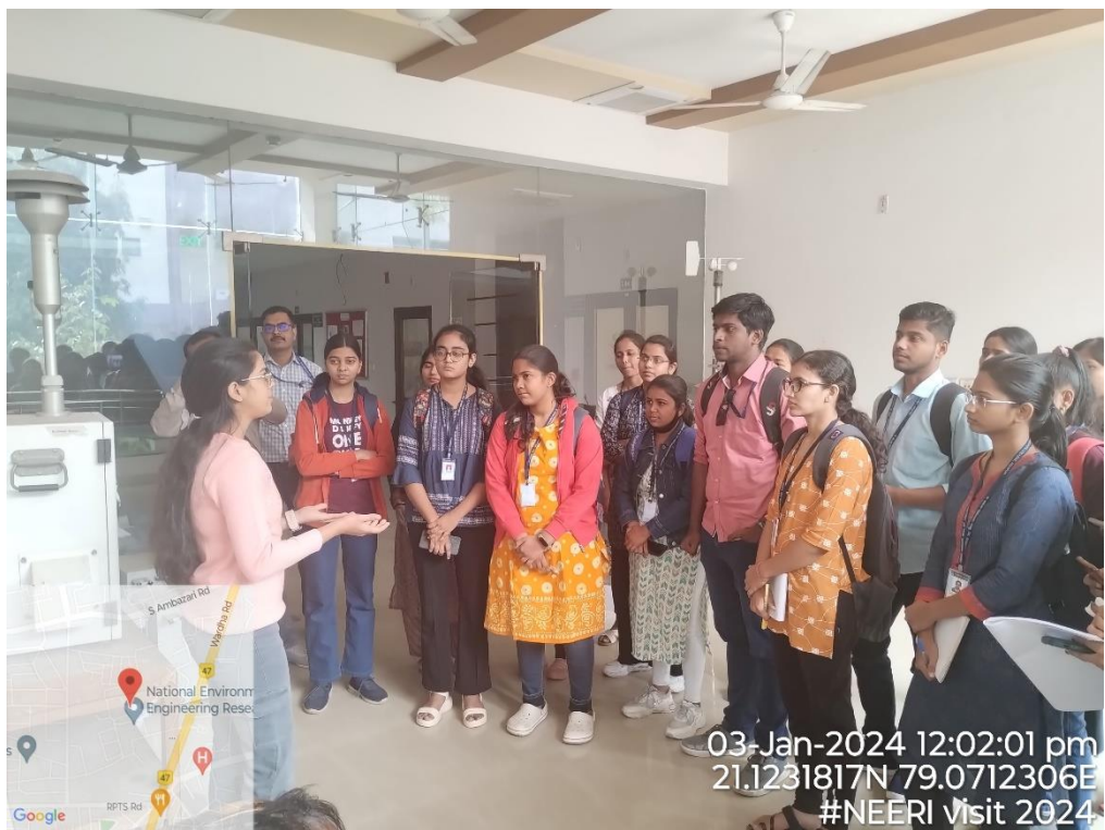
Visit to Air Pollution Control Division