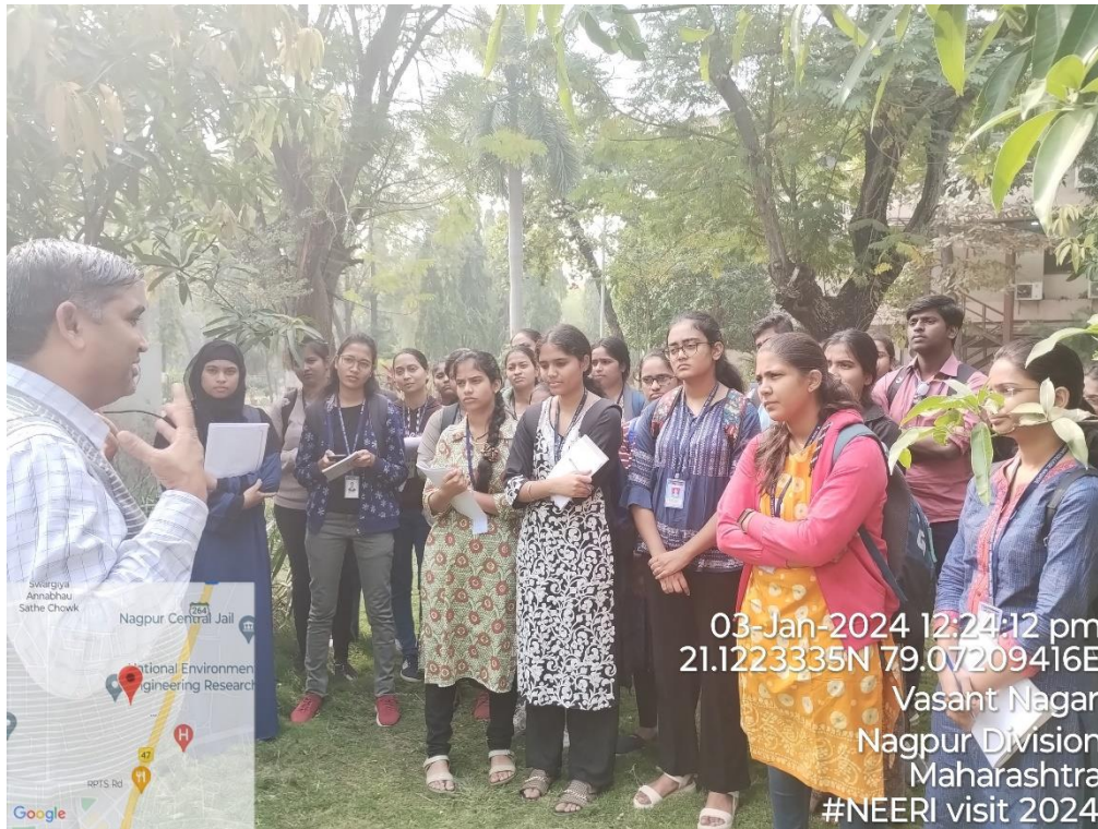
Visit to Medicinal Plant Garden