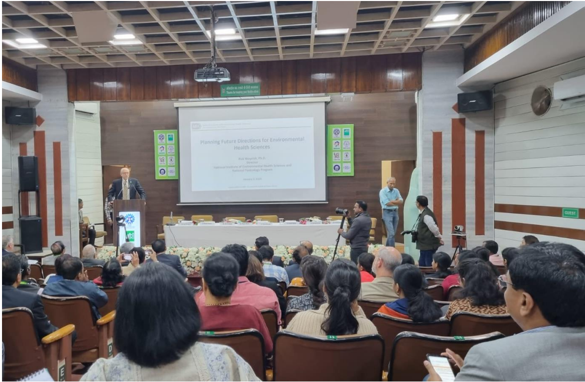
Attending the Inaugural Session of Indo US Workshop