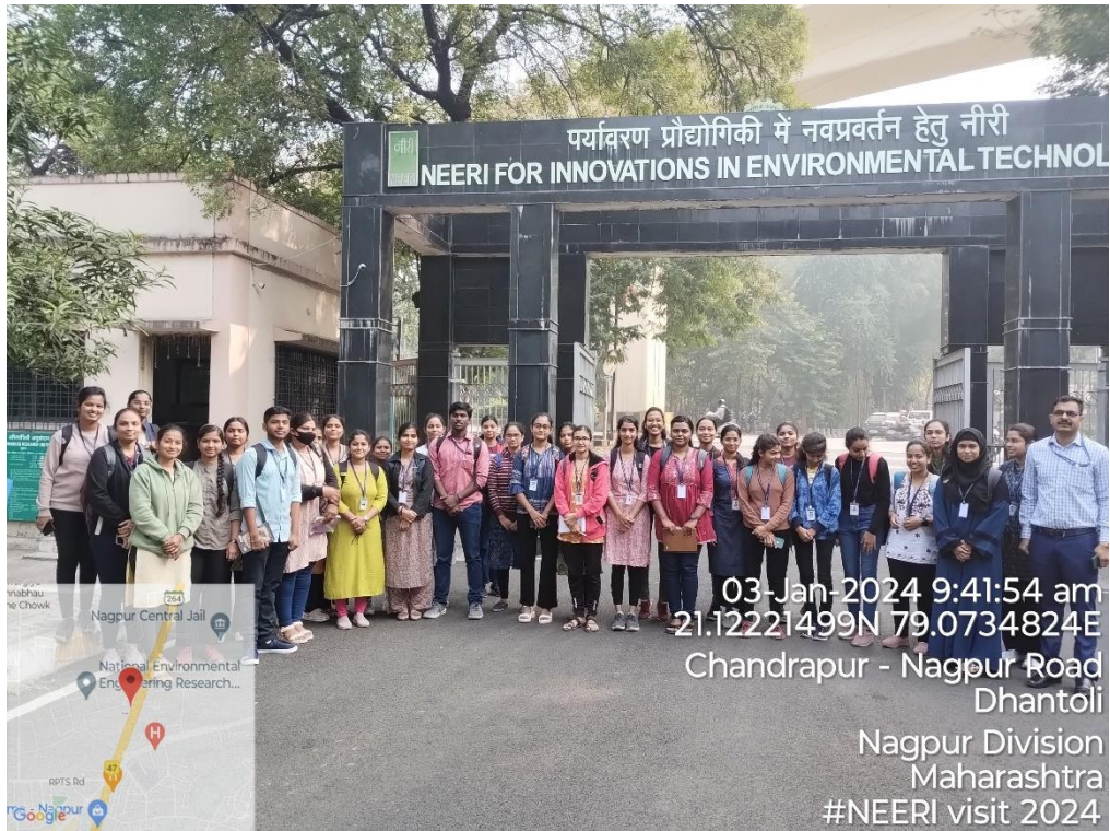
Students and Faculty at the entrance of CSIR NEERI Nagpur