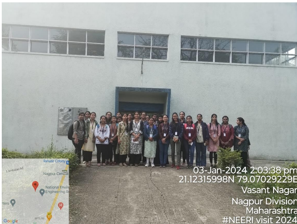
Visit to Fermentation Lab