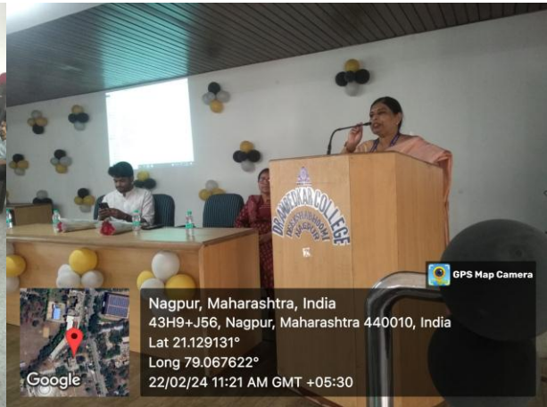
Nagpur, Maharashtra, India 43H9+J56, Nagpur, Maharashtra 440010, India Lat 21.129131° Long 79.067622° 22/02/24 11:21 AM GMT +05:30