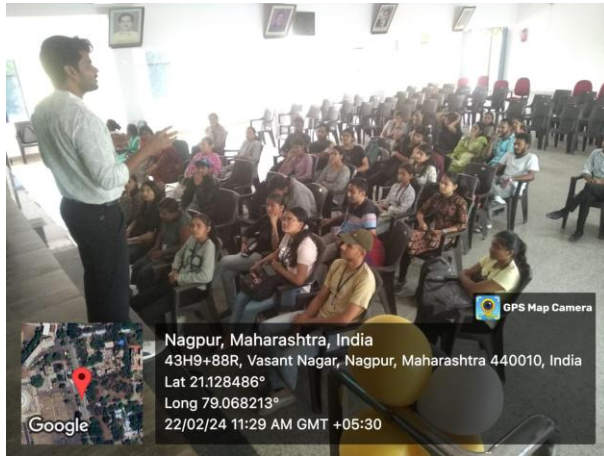
Nagpur, Maharashtra, India 43H9+88R, Vasant Nagar, Nagpur, Maharashtra 440010, India Lat 21.128486° Long 79.068213° 22/02/24 11:29 AM GMT +05:30