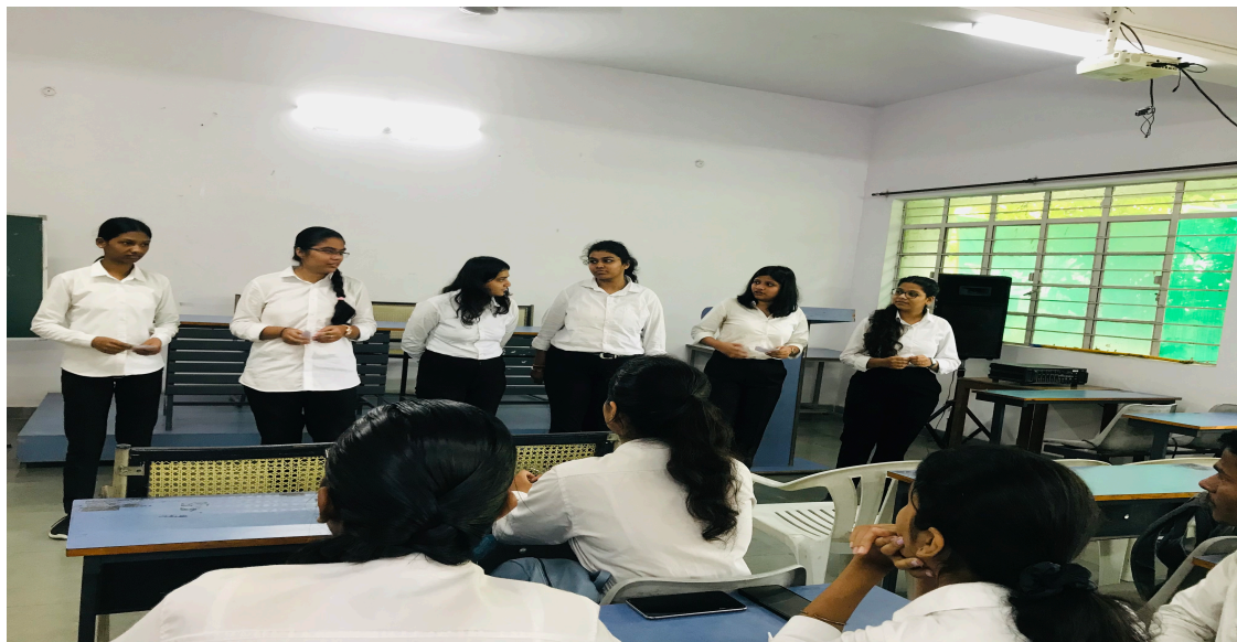
Participants during the session