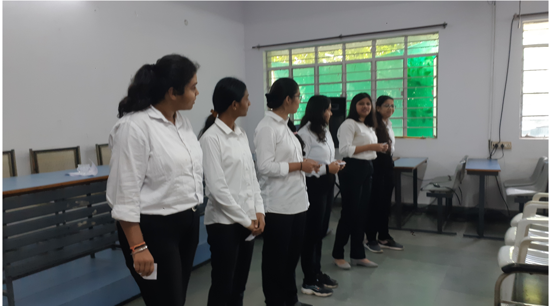
Participants during the session