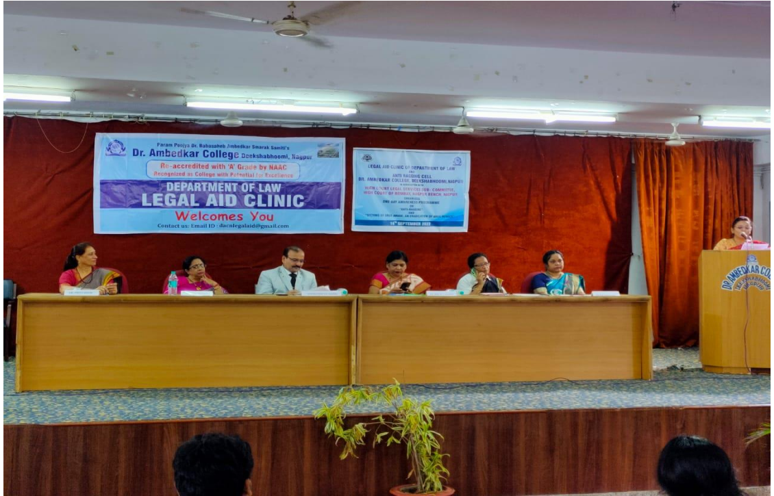
(Dignitaries on the Dias)