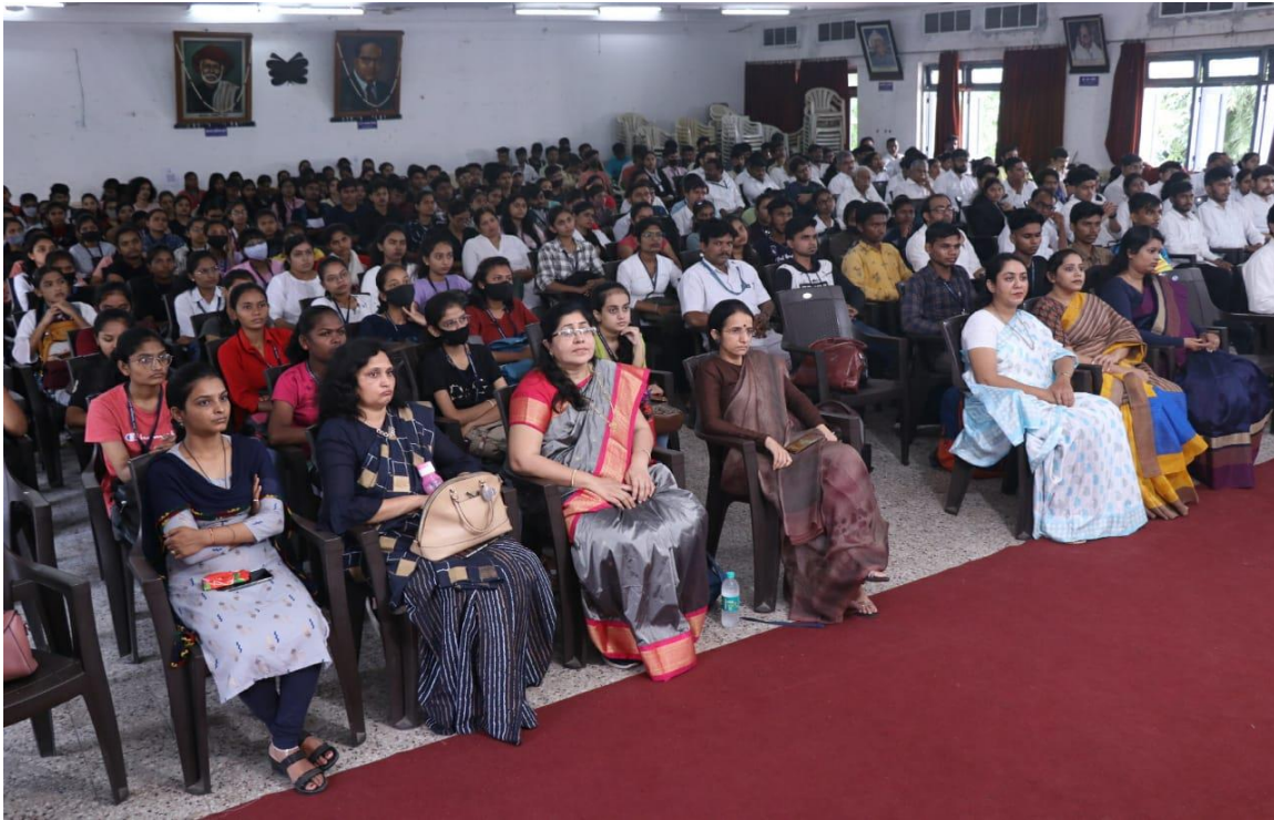
(Audience Present at the Awareness Programme)