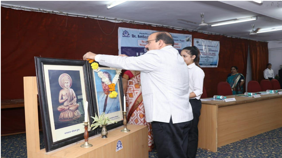
(Hon'ble Dignitaries lighting the lamp and invoking the Blessing of Tahagat Bhagwan Gautam Bhuddha and Parampojya Dr. Babasaheb Ambedkar)