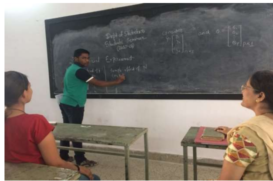
Student explaining the topic to other students