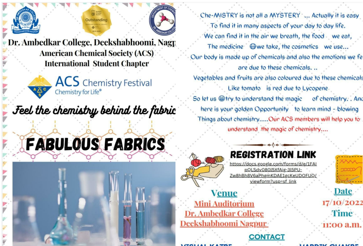
Brochure of the event