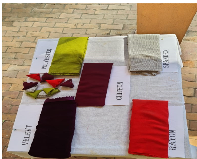
ACS Student Chapter members conducting offline National Chemistry Week 2022 (Fabulous Fabrics)