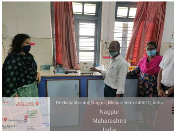
Teaching and Non-Teaching Staff Members attending the Workshop