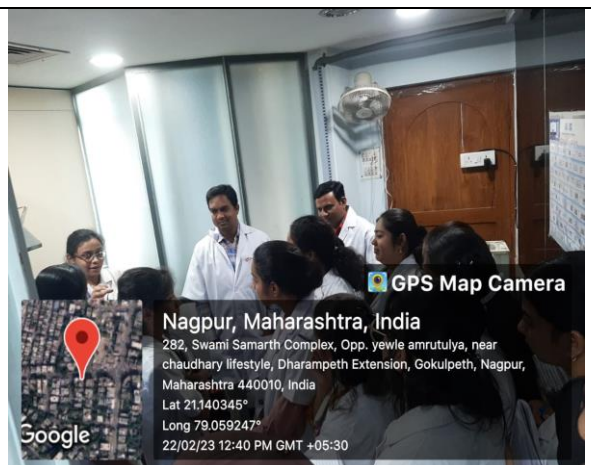
Demonstration of Atomic absorption spectrophotometer by Industry Expert