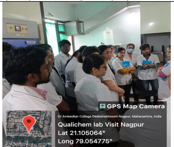
Students interacting with QA/QC expert