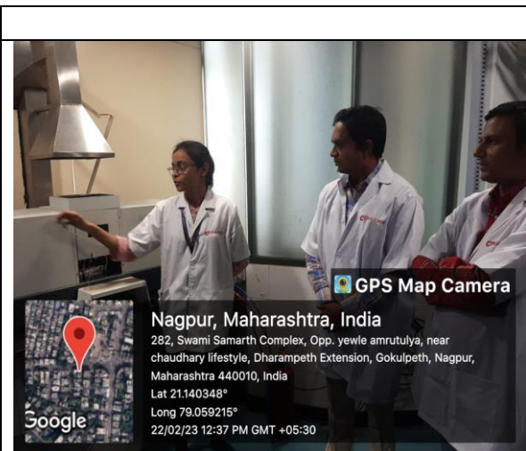
Demonstrations of GCMS by Industry Expert