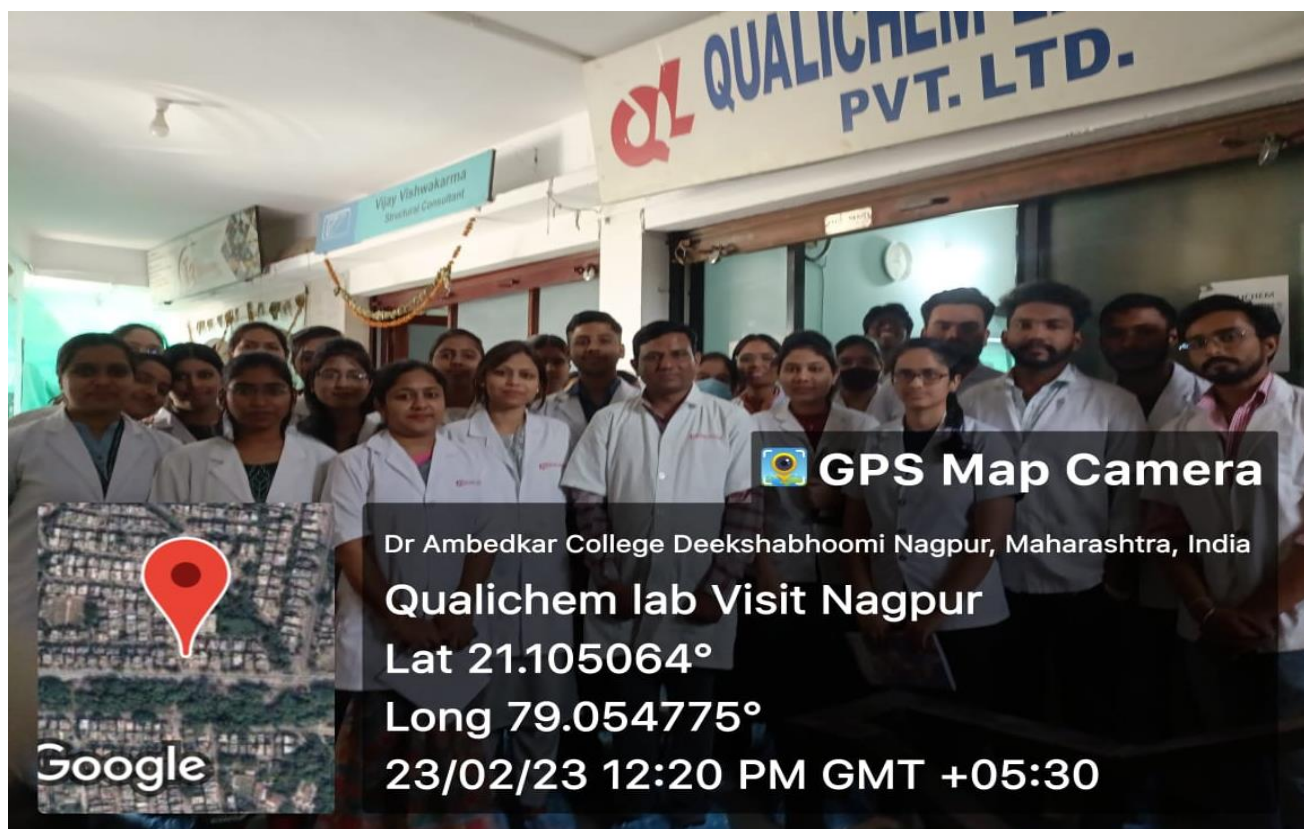
Students and faculty members at Qualichem Pvt. Ltd Nagpur