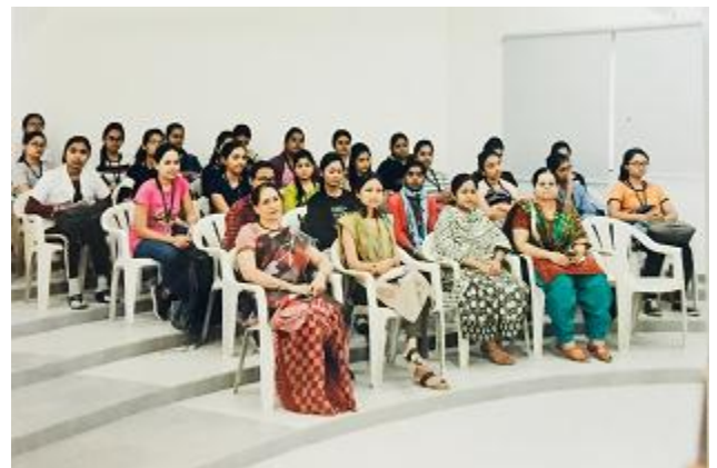
Audience at the second day of workshop