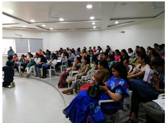
Participants of the workshop