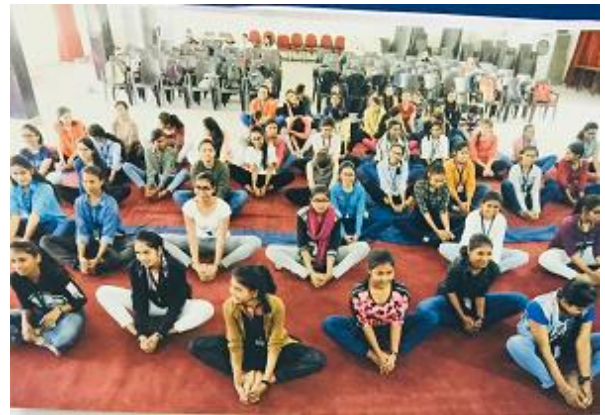
Participants performing ASANAS