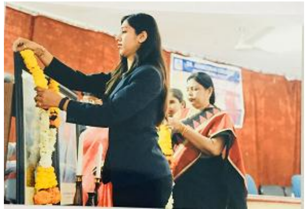
Garlanding the portraits of Tathagat Gautam Buddha and Dr. Baba Saheb Ambedkar