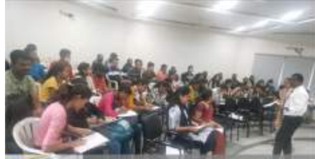
2022-11-19(Sat) 02:47(PM) Nagpur Maharashtra India 27°C 81°F