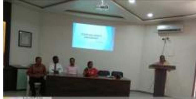
2022-11-19(Sat) 02:01(PM) Nagpur Maharashtra India 27°C 81°F