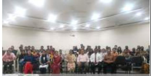
2022-11-19(Sat) 03:06(PM) Nagpur Maharashtra India 27°C 81°F