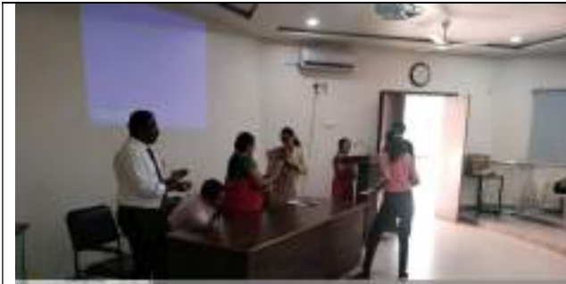
2022-11-19(Sat) 01:57(PM) Nagpur Maharashtra India 27°C 81°F