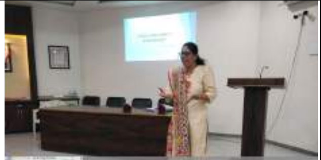
2022-11-19(Sat) 02:06(PM) Nagpur Maharashtra India 27°C 81°F