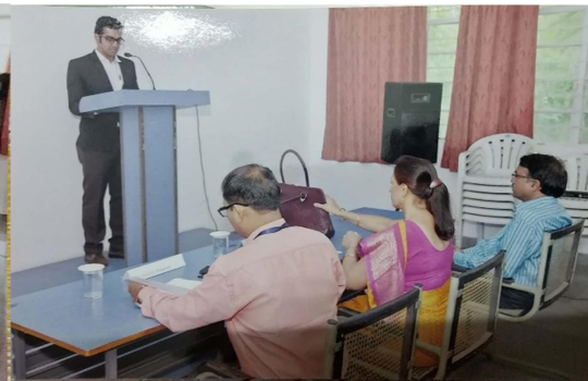
Student participation in the event