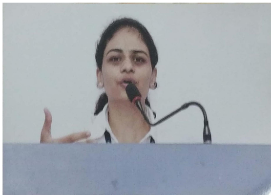
Student participation in the event