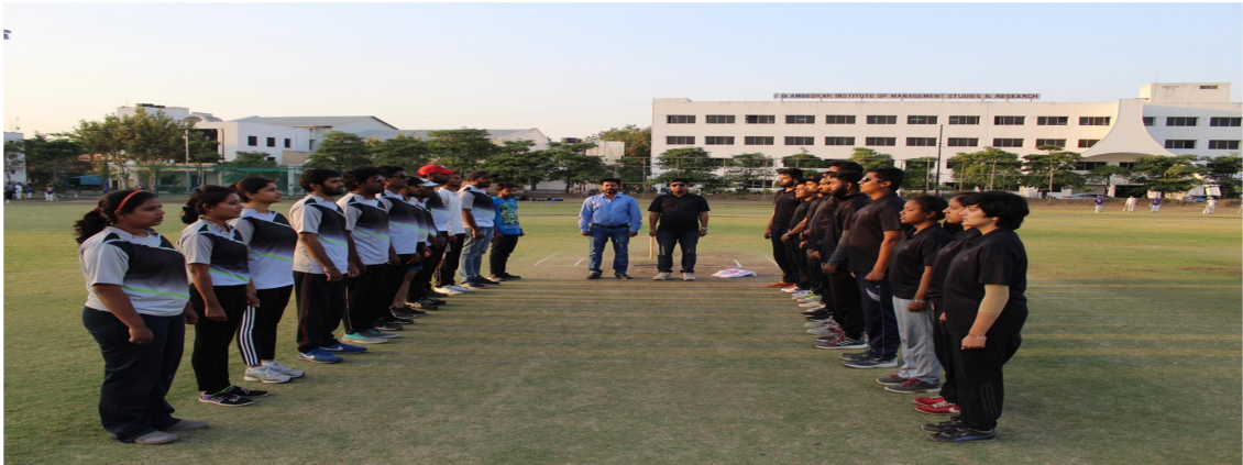
STUDENTS READY TO PLAY