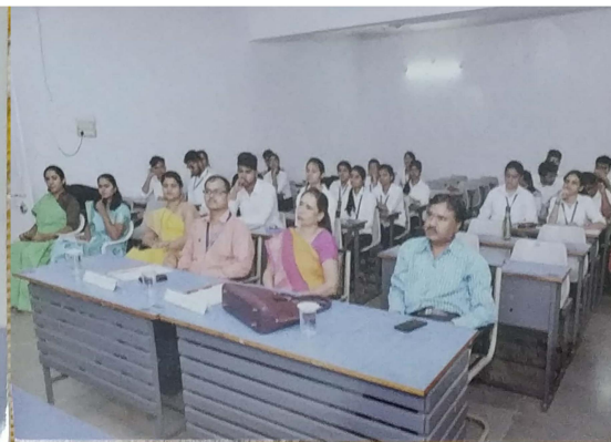
Judges judging the competition