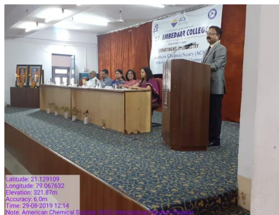
Latitude: 21.129109 Longitude: 79.067632 Elevation: 321.87m Accuracy: 6.0m Time: 29-08-2019 12:14 Note: American Chemical Society (ACS) International Student Chapter