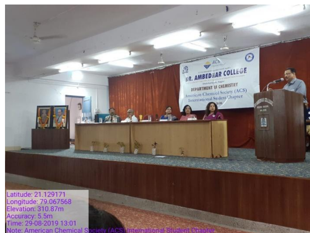
Latitude: 21.129171 Longitude: 79.067568 Elevation: 310.87m Accuracy: 5.5m Time: 29-08-2019 13:01 Note: American Chemical Society (ACS) International Student Chapter