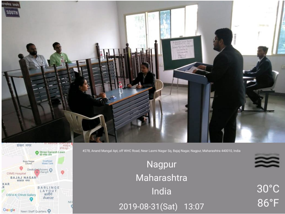
Figure 4 DEMO OF MOOT COURT IN PROGRESS