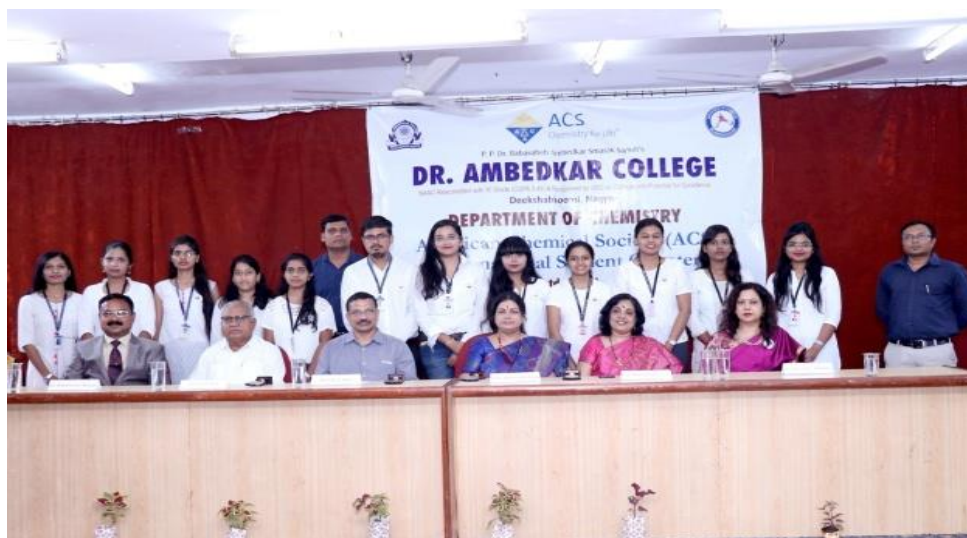
ACS student members with the dignitaries