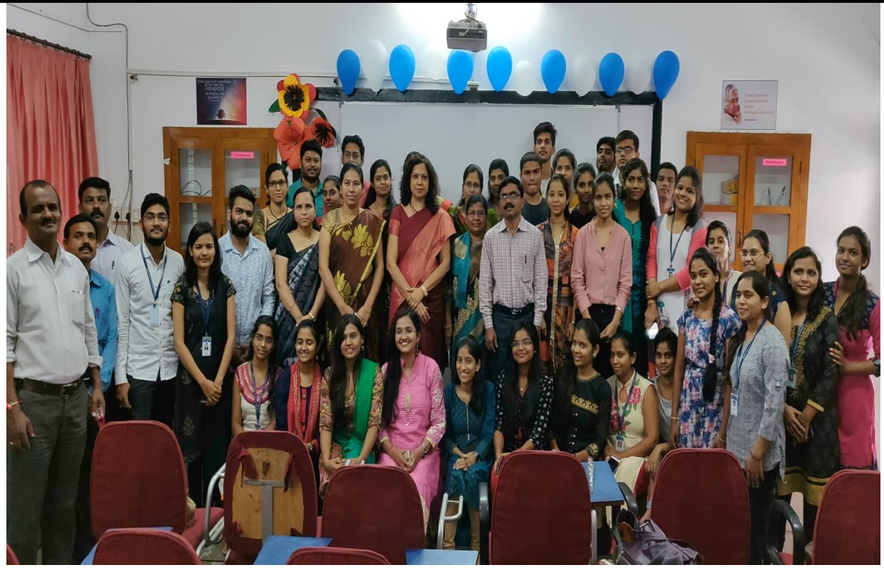
Teachers and students during the programme