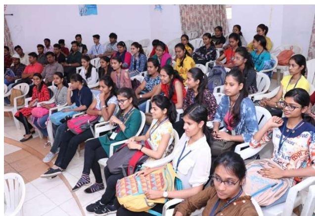
Students of Dept of Statistics participating in STAT-FEST