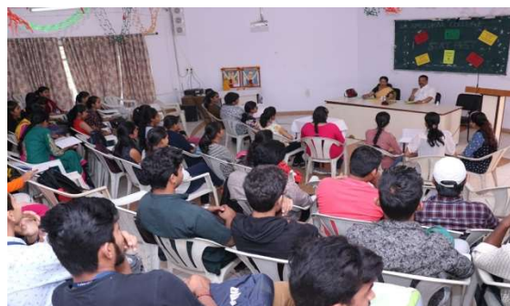
Quiz Competition in progress