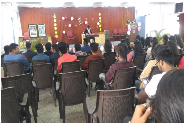
Instrumental music by Ankit Panchbhai.