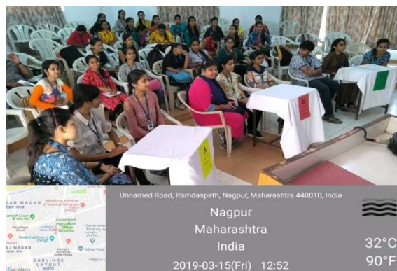
Participating Teams and the audience