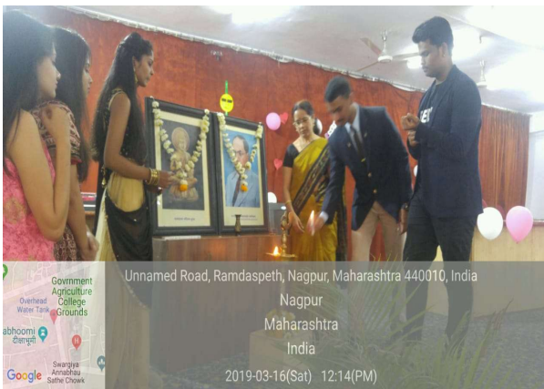
Students lighting the traditional lamp

The students of Department of Statistics organized cultural event competition as a part of Stat-Fest. The cultural events evoked an unprecedented response from student community. The enthusiastic students took lot of pains and invested a good amount of time and energy practicing for various events such as dance, singing, recitation of poems, fashion show and for planning various games. They enjoyed every minute of this event and participated in all activities whole heartedly.