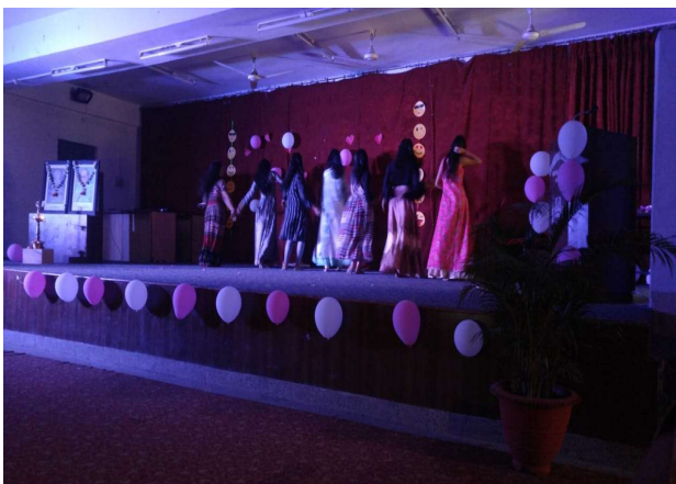
Dance performance by second year students.