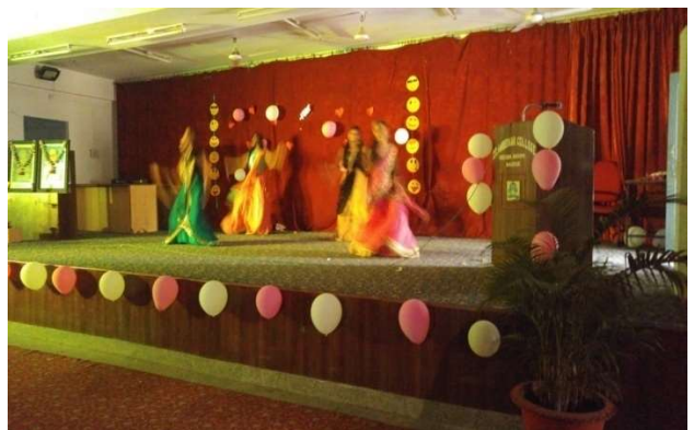
Dance performance by final year students