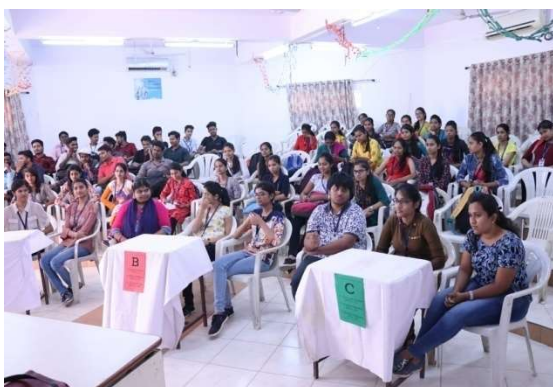
Participating Teams and the audience