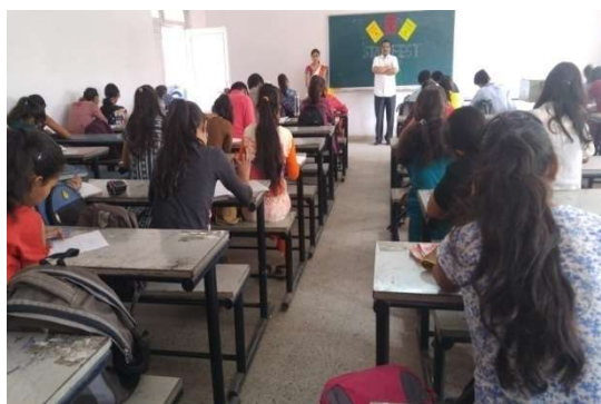
"STATABILITY" Competition 2018-19 in progress