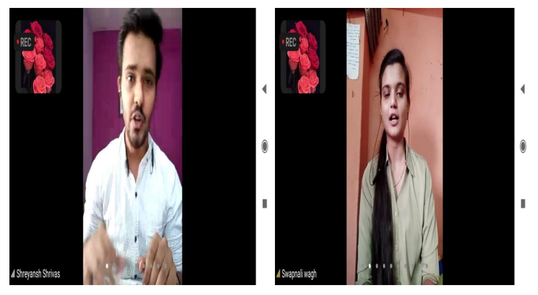
(Participants presenting their views on the debate topic)