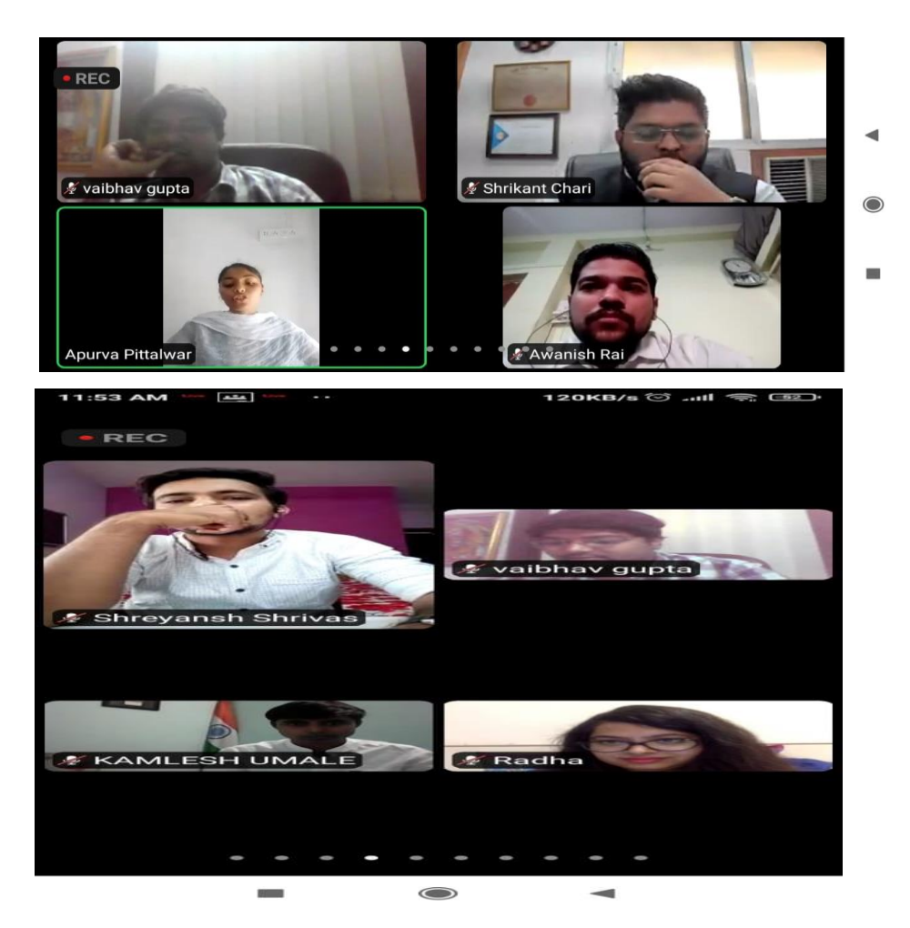
(The Participants and students present in the competition)