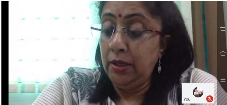
Figure 1: HEAD, DEPT OF LAW ADDRESSING THE PARENTS