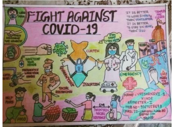
2 nd prize