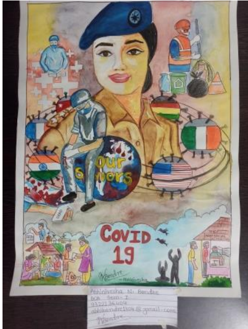
1 st Prize