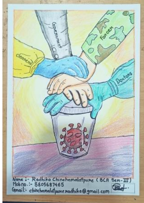
3 rd Prize