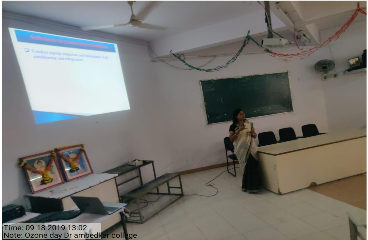
Time: 09-18-2019 13:02 Note: Ozone day Dr ambedkar college