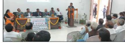
One of the guests delivering speech during the programme at Dr Ambedkar College.