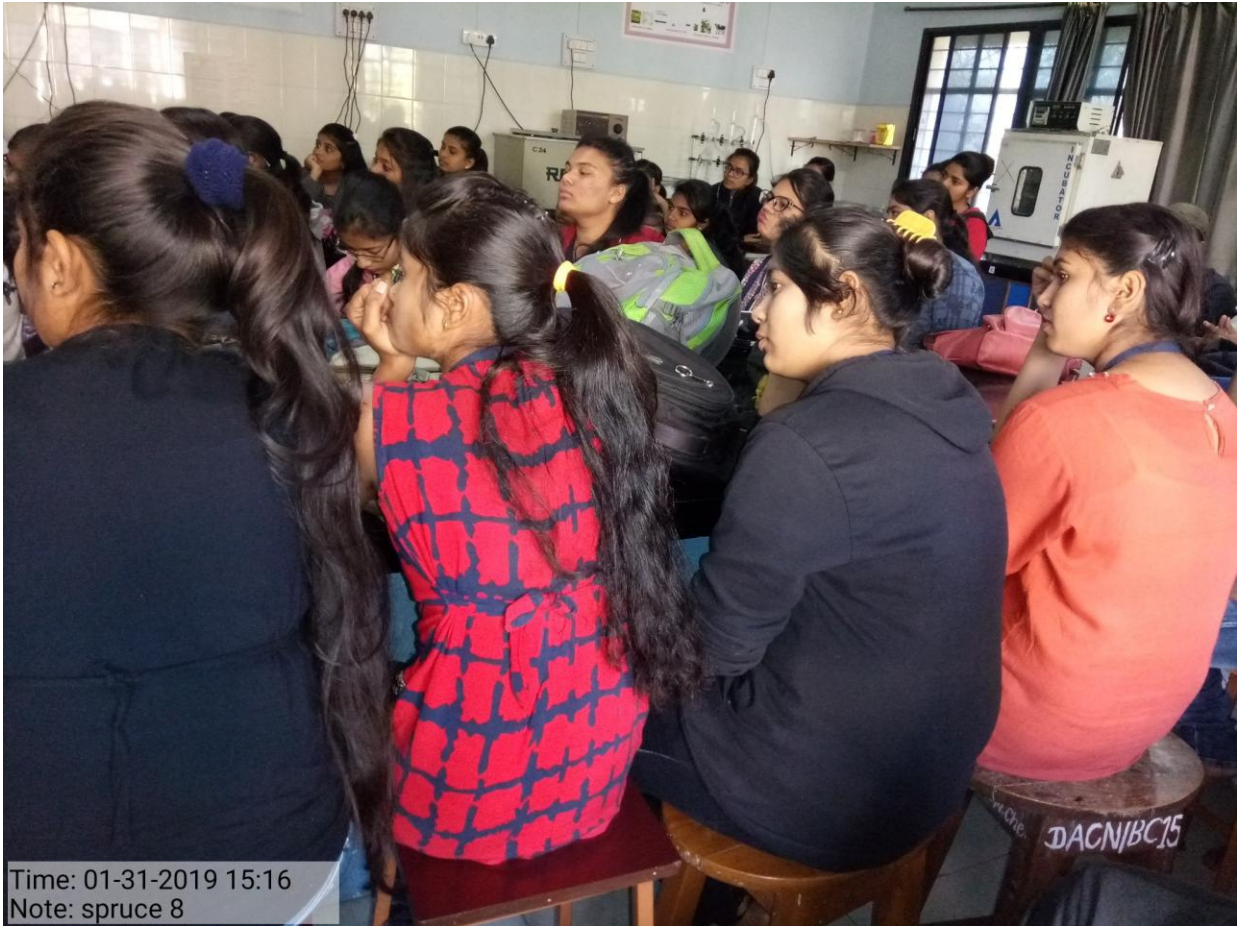
Time: 01-31-2019 15:16 Note: spruce 8