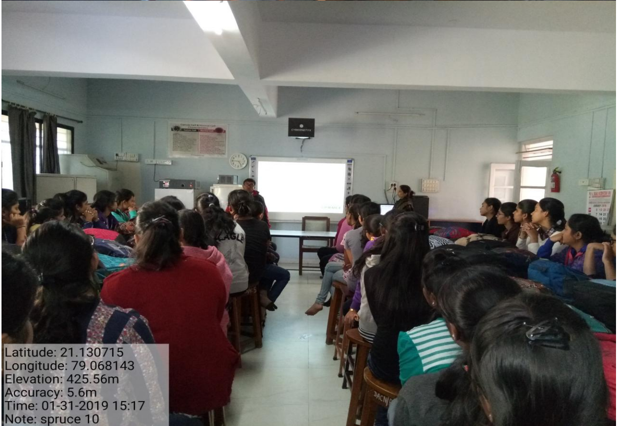
Latitude: 21.130715 Longitude: 79.068143 Elevation: 425.56m Accuracy: 5.6m Time: 01-31-2019 15:17 Note: spruce 10