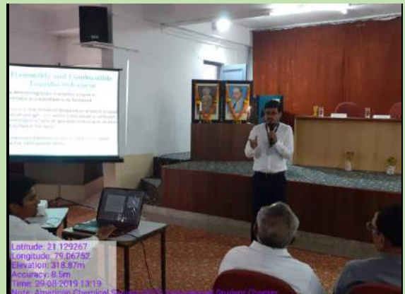
Latitude: 21.129267 Longitude: 79.06752 Elevation: 318.97m Accuracy: 8.5m Time: 29-08-2019 13:19 Logo: American Chemical Society, Maharashtra Student Chapter