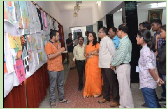
Gondia Rd, Madagi, Maharashtra 441913, India Madagi Maharashtra India 26°C 79°F 2019-10-10(Thu) 05:31(PM)