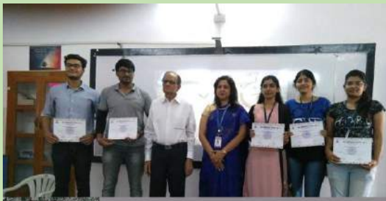
MA 22, S Ambazari Rd, Laxminagar, Nagpur, Maharashtra 440010, India Nagpur Maharashtra India 35°C 95°F 2019-03-12(Tue) 13:33