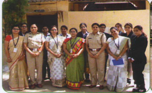
Health Awareness Programme : Department of Law