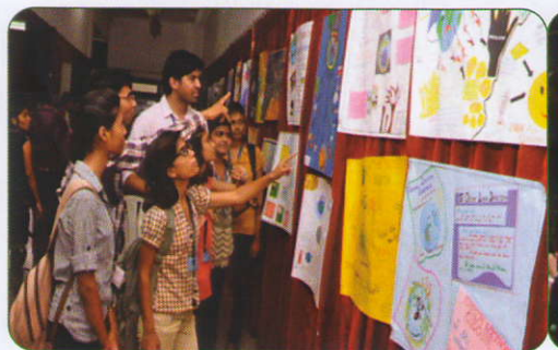
Poster competition organised on the occasion of "World Ozone Day": Department of Chemistry