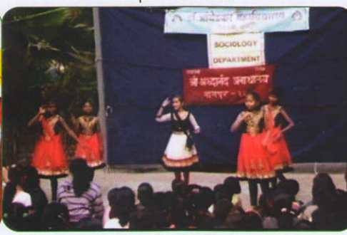
Cultural Event at Shraddhanand Orphanage