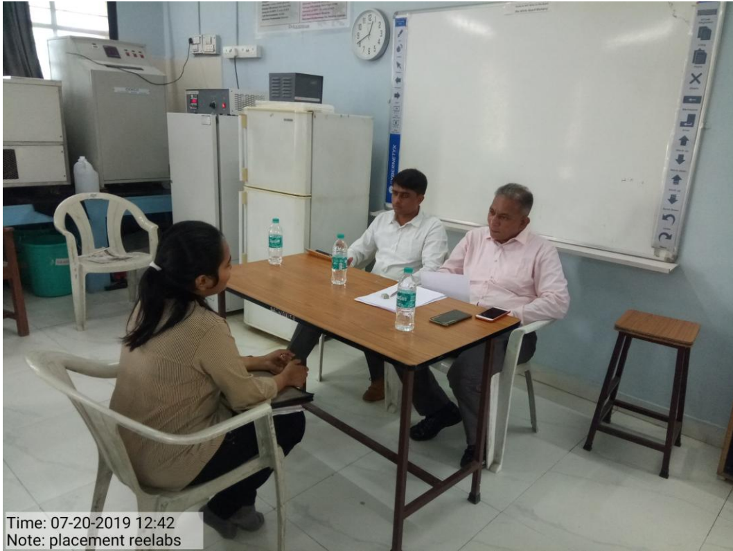
Time: 07-20-2019 12:42 Note: placement reelabs