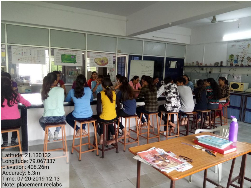
Latitude: 21.130132 Longitude: 79.067337 Elevation: 408.26m Accuracy: 6.3m Time: 07-20-2019 12:13 Note: placement reelabs